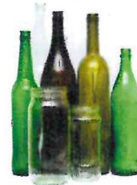
Glass Bottles & Jars (Empty food & beverage bottles & jars)