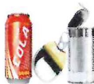
Aluminum & Steel Cans (Empty food & beverage cans)