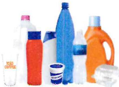
Plastic Bottles, Jugs, Tubs, & Lids (Empty kitchen, laundry, & bath containers & clamshells)