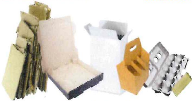
Cardboard & Boxboard (Clean & dry)