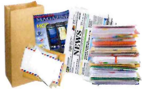
Junk Mail, Periodicals, & Office Paper (Paper bags, envelopes, & catalogs)